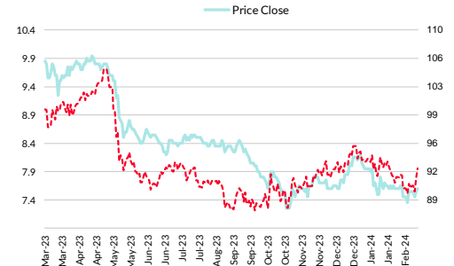
Land and Houses (LH TB)